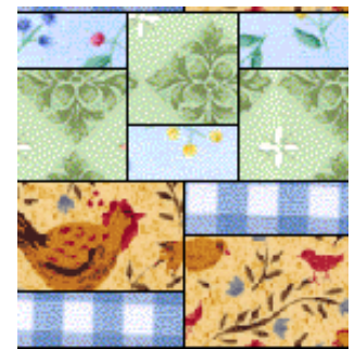
Hodge-Podge Block Unit

Fabric A & C ..... Cut 4 each color strips 2 1/2" x 42"