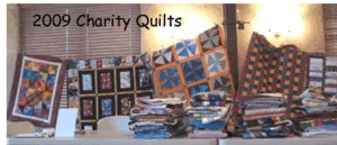
2009 Charity quilts and pillowcases.