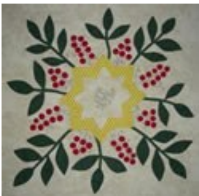
Rev. Roberts Star Block

The Thursday 9/23 class will be the Wreath Block, and the Friday, 9/25 class will be the Rev. Roberts Star Block.